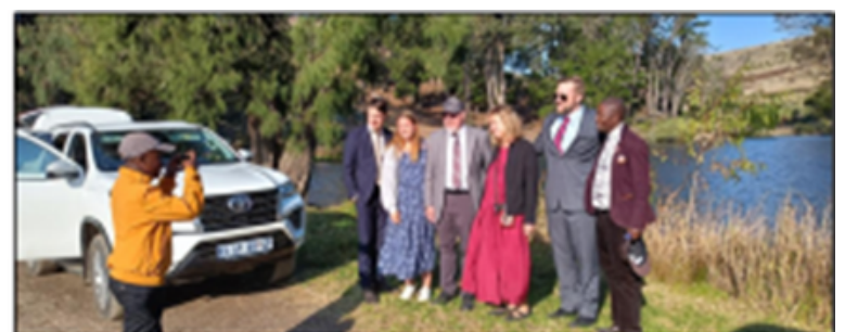
The visiting team at a river baptism the day after landing.

NorthBridge Church Short Term Trip Missionary Perspective by Greg Akers