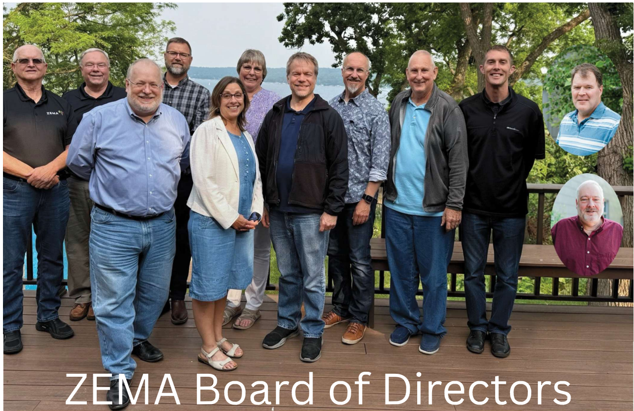
ZEMA Board of Directors